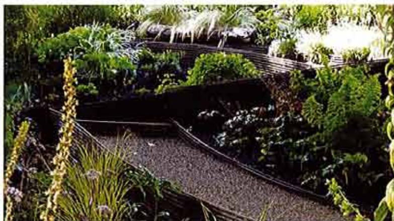
Water Gems' award-winning private garden in Edinburgh